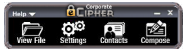
eCipher Desktop Client